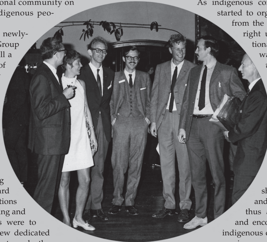
Some of IWGIA's founding members

Soon, the newly-formed Work Group began what is still a core element of IWGIA's activity today: documenting cases and situations relating to indigenous peoples and disseminating information to the wider world as to what is going on. Years of hard work, frustrations and limited funding and human resources were to follow, while a few dedicated volunteers, students and others joined this important effort. Looking back, it is impressive to note how a small group of people not only demonstrated extreme dedication to an ongoing struggle but also managed to develop and professionalize IWGIA's documentation and communication work. From day one, IWGIA was - and made great efforts