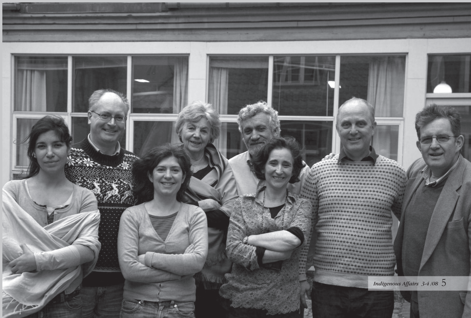
IWGIA's board in 2008

As the years passed, IWGIA decided to expand its activities from the original documentation and dissemination work to also include concerted efforts and engagement with international human rights work and advocacy. We also developed new methods and approaches by which to support our project