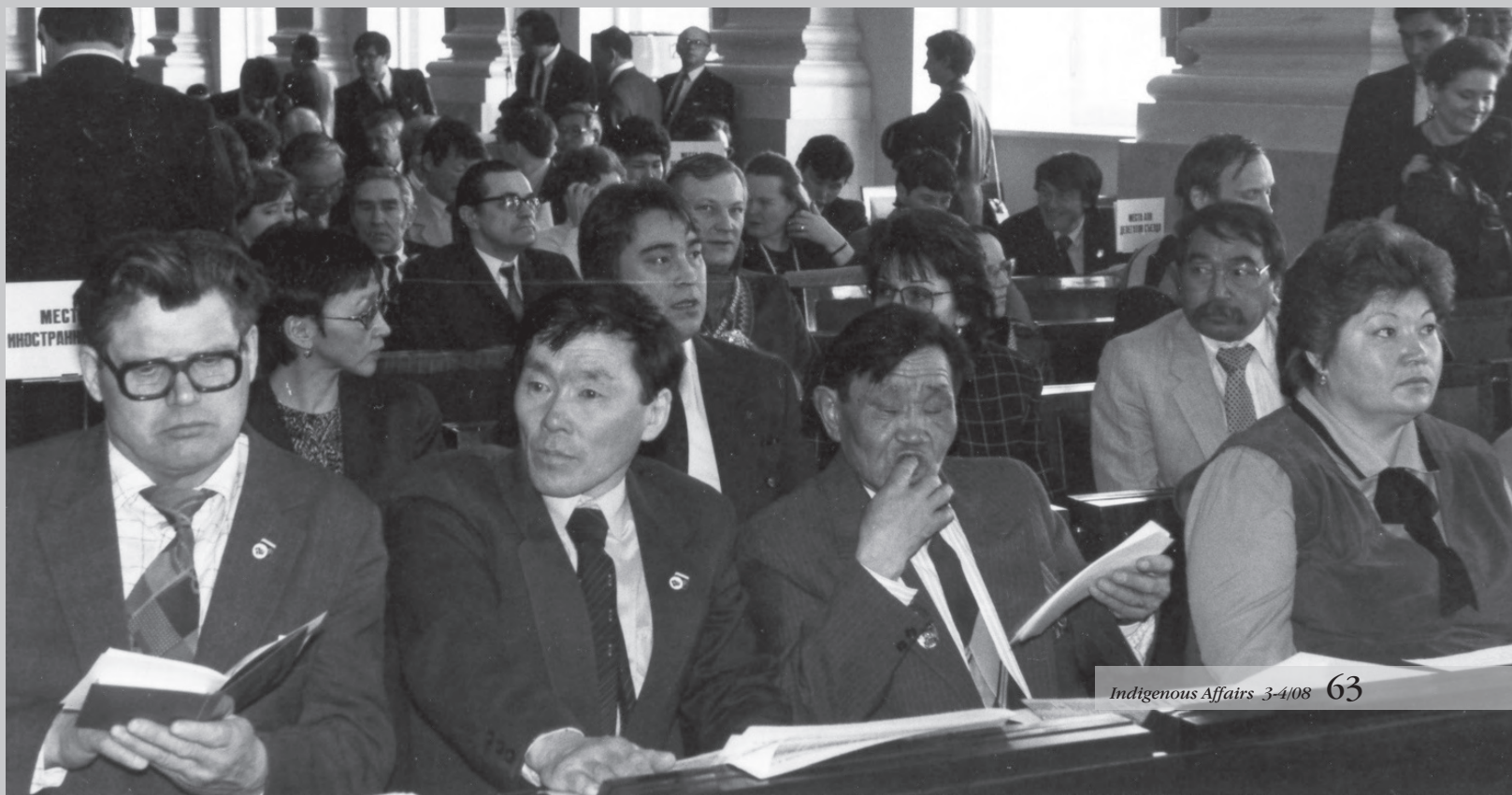
The first congress of the "Small People of the North", Moscow 1990