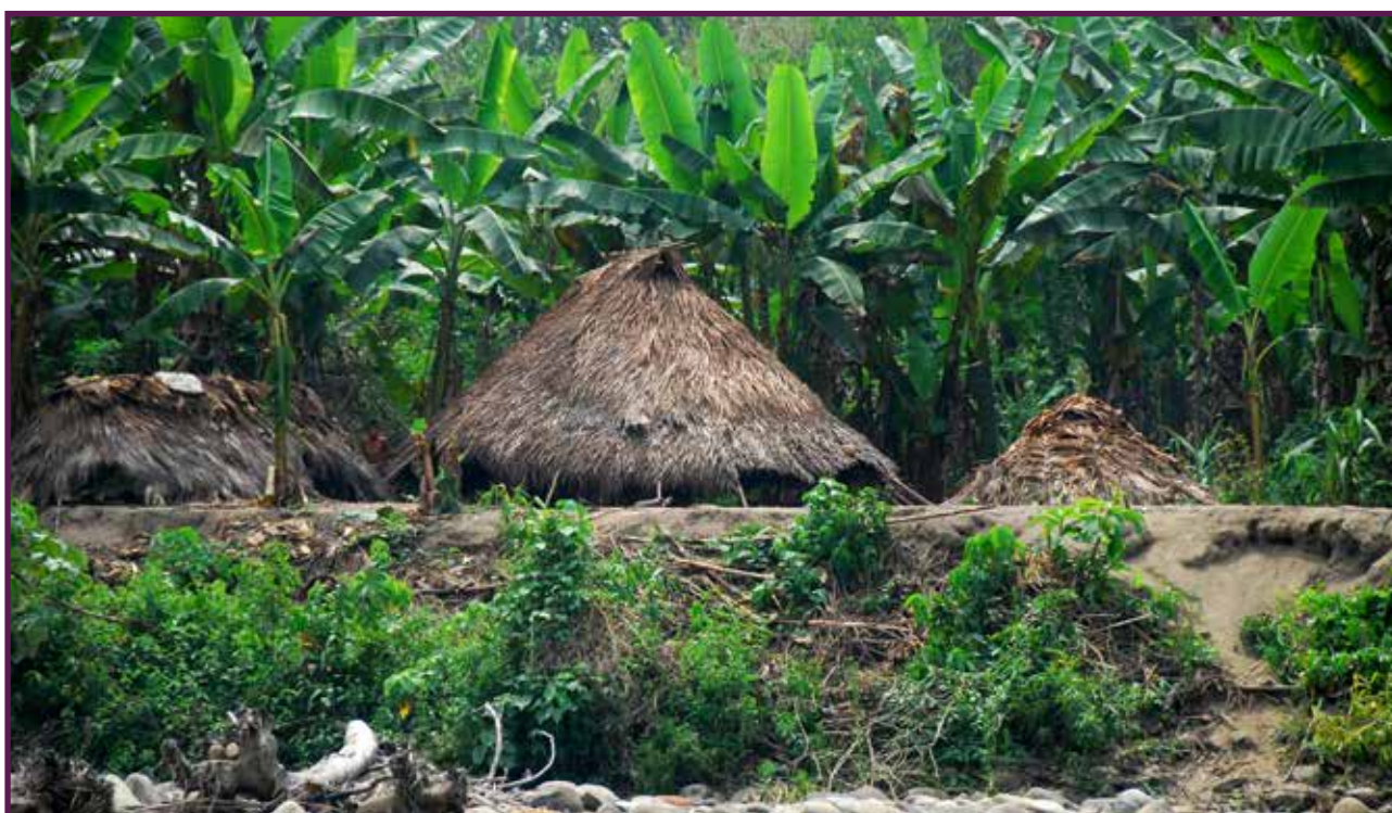
Houses of Matsigenka-Nanti, Timpía river.

The right to self-determination also implies that, if indigenous peoples decide to increase their interactions with the surrounding society, this course of action should be respected, ensuring that their physical, sociocultural and territorial security is guaranteed, as well as the time and space necessary for them to develop immunological defense mechanisms and sociocultural means of adaptation for the plethora of new situations that arise as result of increased interaction. Therefore, the periods of adaptation could be lengthy, a gradual process that is not linear, but reversible, as indigenous peoples might decide to go back into isolation, just like it has happened with part of the Mashco Piro, Mbya Guaraní and Matsigenka peoples, among others. It is worth noting that none of the peoples that engaged in initial contact in Peru adopted this condition by their own accord; on the contrary, they were subjected to processes of forced contact by economic and religious agents, which led to severe losses in territory and population, as well as political and social un-structuring.