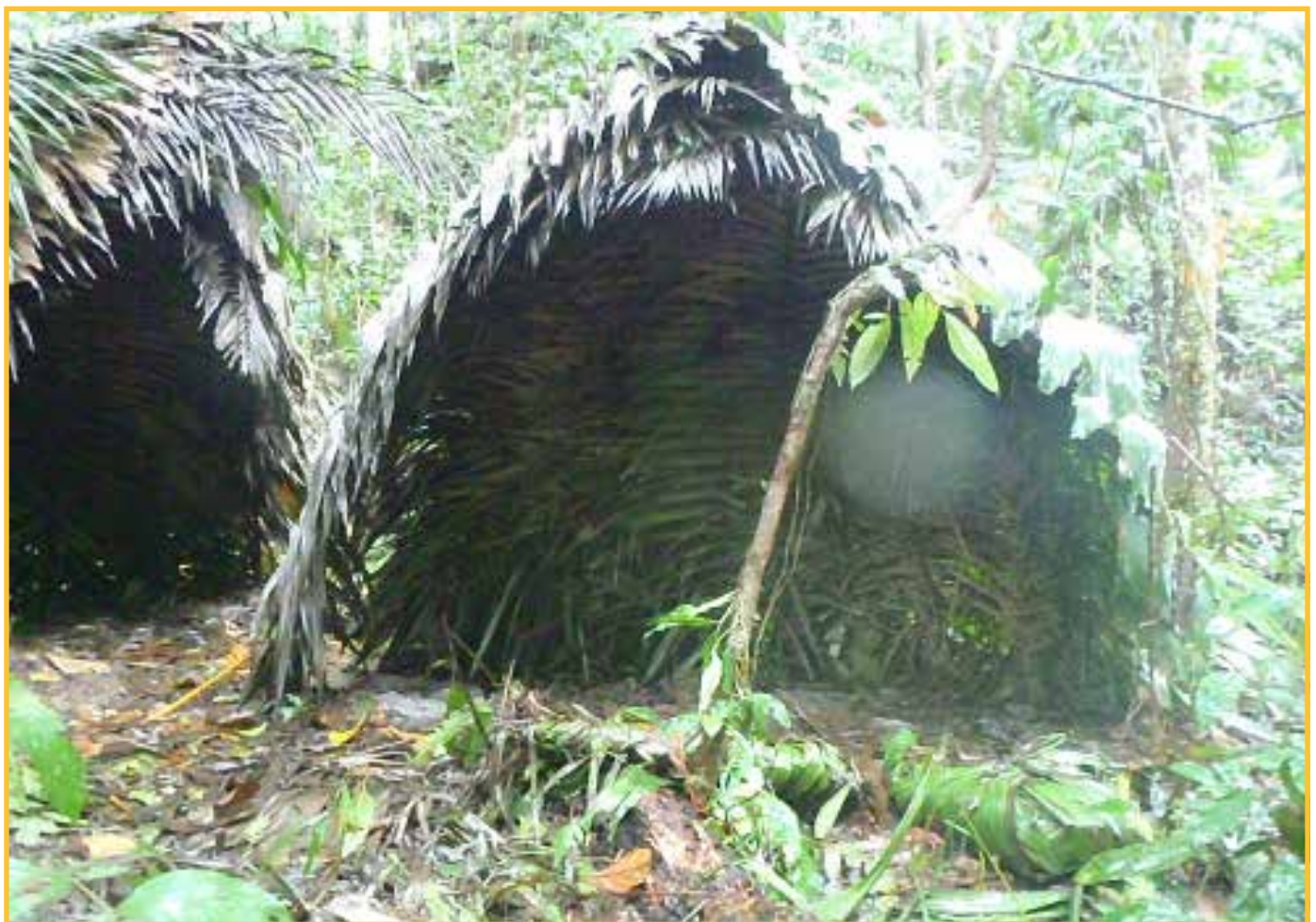
Temporary settlements of indigenous families in Yurúa, Ucayali.

The indigenous peoples of Peruvian Amazonia have gone through similar processes due to the great number of deaths caused by the diseases spread as a consequence of forced contact. The peoples that faced these situations during the second half of the 20th century include the Harakbut, the Matsigenka, the