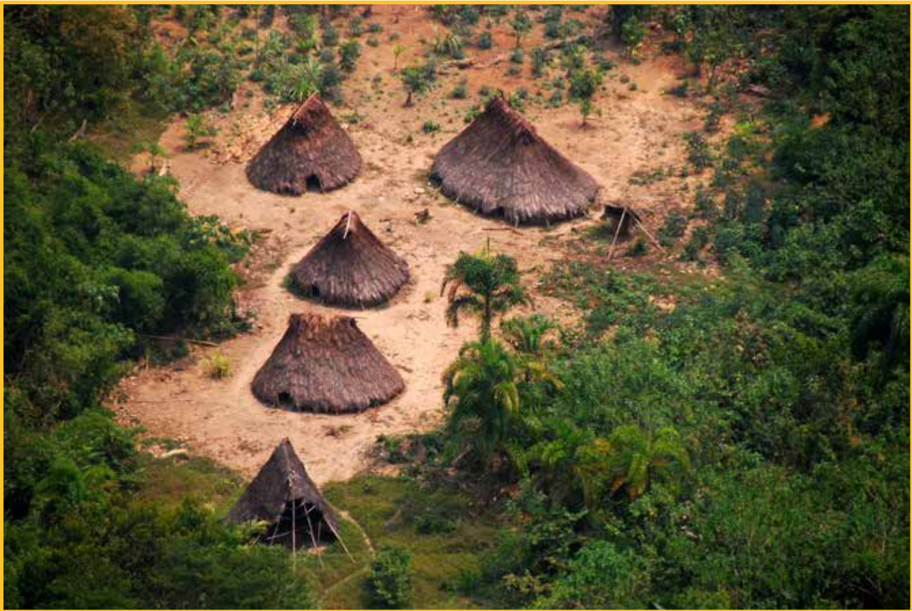
Houses of Matsigenka-Nanti, Timpía river.

Throughout the 1990's, the Interethnic Association of Peruvian Amazonia (AIDSESP), a national Amazonian indigenous organization that had been managing the legal regularization of the lands of native communities, proposed before the State the creation of four territorial reserves for the peoples in isolation of the department of Ucayali: Murunahua, Mashco Piro, Isconahua and Kakataibo. Their technical team was in charge of conducting the respective studies 2 . The first three reserves were created between 1997 and 1998 through regional norms, while the fourth has not yet been established.