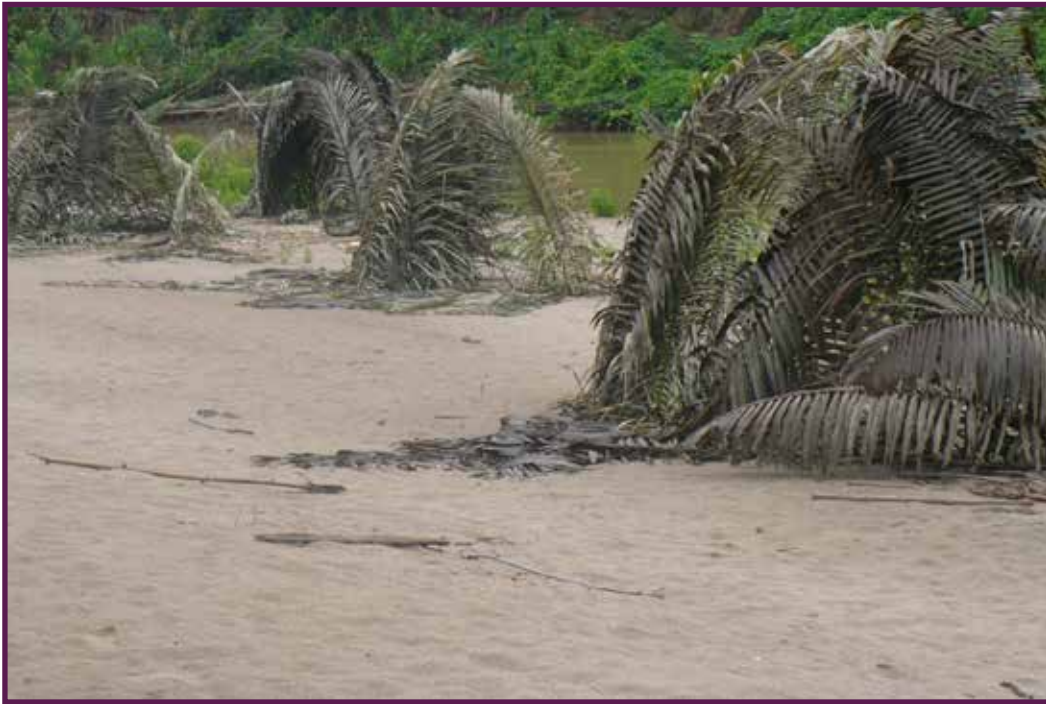
Temporary settlements of isolated indigenous families.

As a result of these proposals and recommendations, as well as the advocacy work conducted by AIDSESEP, allied organizations and the Office of the Ombudsman, in 2006, The Protection of Indigenous or Aboriginal Peoples in Voluntary Isolation or Initial Contact Act (Act No. 28736) was enacted. Following the recommendation by the Office of the Ombudsman, this law established a new category, that of the indigenous reserve, and ordered the creation of a special trans-sectoral legal protection regime. However, the lobbies of the economic sector, particularly, of hydrocarbons, managed to dramatically debilitate the territorial rights of the peoples in isolation and initial contact. This opened the door for the possibility of authorizing activities of exploitation of natural resources, through the argument of public necessity within the indigenous reserves.