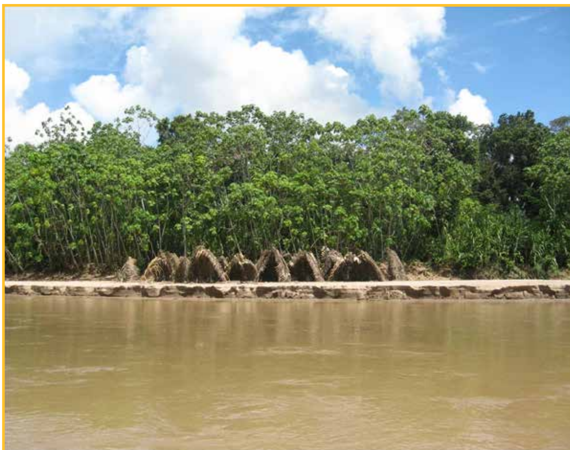
Temporary settlements of indigenous peoples in Purus, Ucayali.

consequence, many reactions of rejection arose among indigenous organizations, specialists and the very Office of the Ombudsman 7 before the lack of solid arguments to justify this decision, given the risks that it entailed for the life and health of the isolated population, and the lack of minimum conditions within the State to confront its effects. In spite of the fact that, little thereafter, the representative of the Vice Ministry walked back on these declarations before the media, a set of anthropologists and other people tied to this institution organized public events oriented towards impetuously promoting the establishment of direct and sustained interaction with these populations, without taking much responsibility for the consequences that it could unleash 8 . Simultaneously, in the high Madre de Dios region, the interactions of the Vice Ministry for Intercultural Affairs with the Mashco Piro population increased notoriously, attracting several members of this people, sharpening their dependence on introduced products, as well as the risk of aggressions (AIDSESP, 2017; CIDH, 2019). Very soon after began the struggles among the groups in isolation, who fought over the objects and supplies delivered by the Vice Ministry for Intercultural Affairs, generating tensions and making the situation unmanageable.