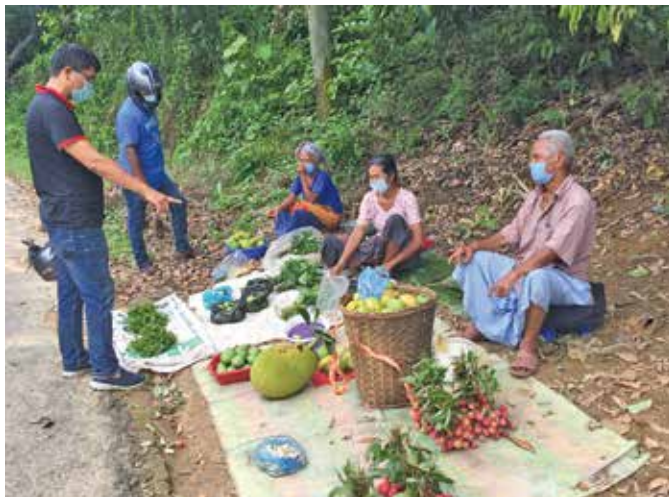
Indigenous farmers selling agricultural crops on the street instead of in the market. The photo was taken in Rangamati in June 2020.

The activities for agricultural crop production are also hampered due to the imposed restriction on mobility, lack of access to fertilizers and closure of local markets to sell the produce. For example, the Mro community living in Baittapara, Bandarban used to depend on Jhum cultivation (shifting cultivation) to produce rice and other local crops. Due to the lack of access to land, they have shifted their livelihoods to farming mangoes and other fruits and vegetables. Due to the lockdown, they are now having to sell their produce at a much lower price but having to buy rice at twice the price. Moreover, the recent Super Cyclone Amphan caused widespread damage in their mango farms. Therefore, they are currently facing food shortage. In addition, because of the lockdown, they could not access fertilizers which is essential for continuing their agricultural work. The community anticipates a severe food crisis if they cannot start their agricultural work soon.