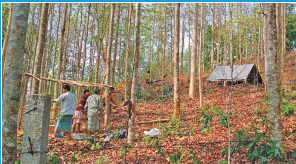
Photo: Indigenous Youths are constructing small isolation houses in the nearest forest. (18 April, 2020 at Nalbania Village in CHT).

14 days of quarantine to prevent the spread of infection. To facilitate their isolation, the indigenous youths are collaborating to construct small isolation houses in the nearest forests.